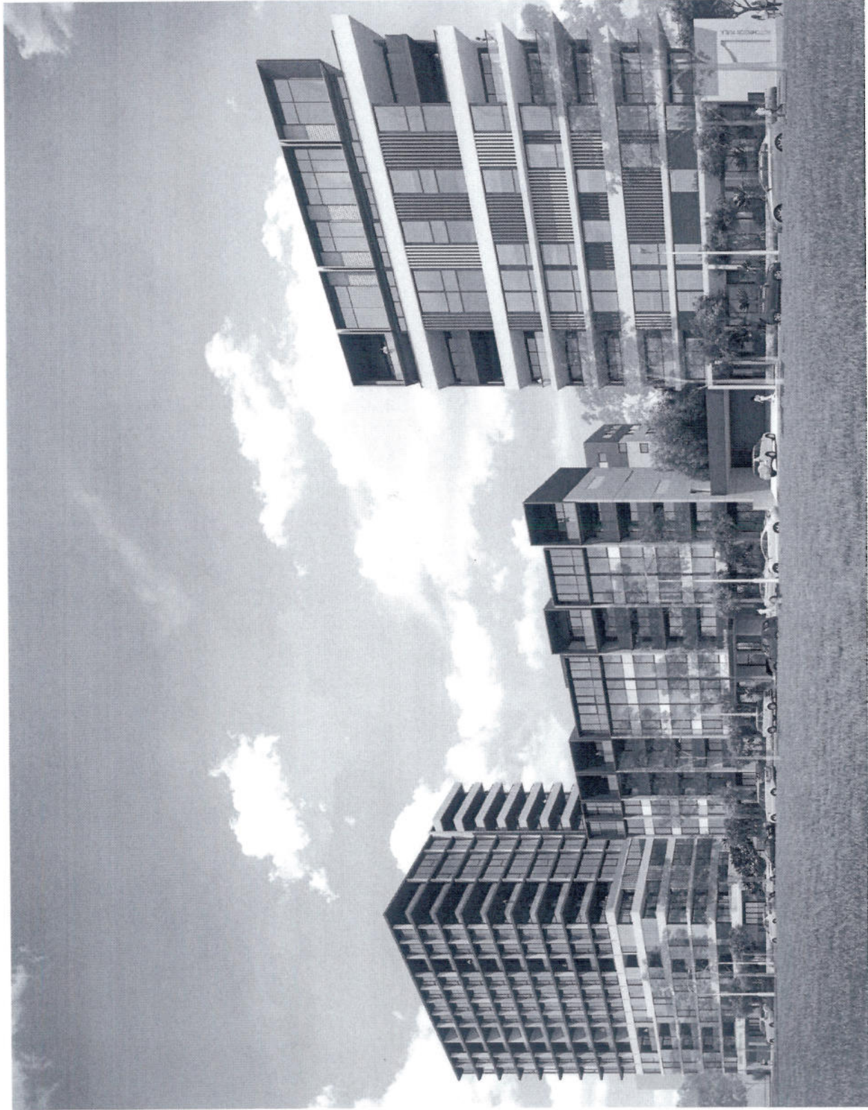
View of Building A, B and C from Hurlford Park

1:0000 Hurlford Park 2024/2025 1:0000 1:0000 1:0000 1:0000 1:0000