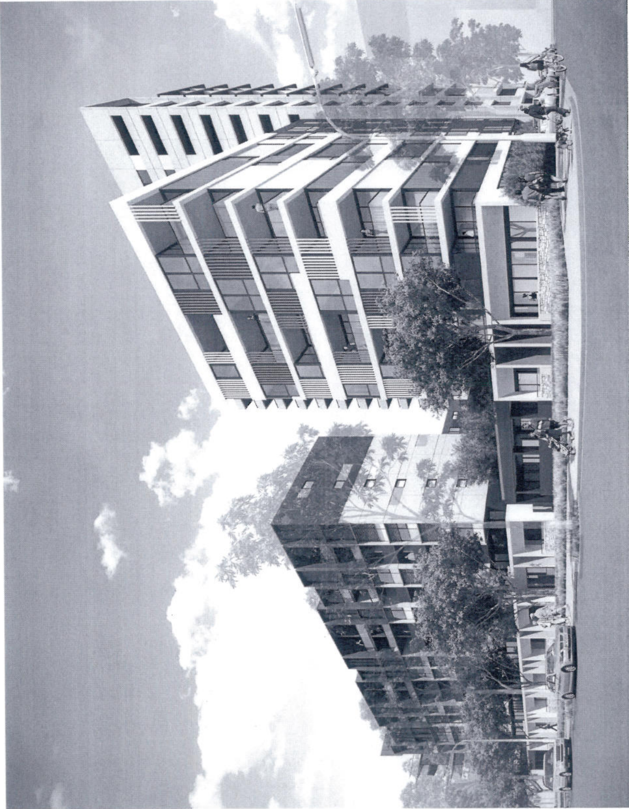
View of Building D & E from corner of Linear Park and Kirby Walk